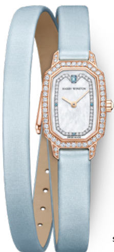
← An understated Harry Winston wristwatch for sneaking glances at the time

You won't find her working the room, but admiring the hostess's faux-bois tea set? Now we're talking. Her own table is alive with flowers and other pretty garden tributes.