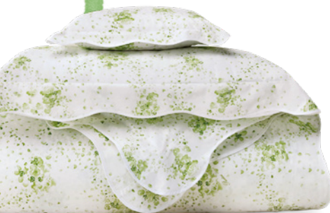
CLOCKWISE FROM TOP LEFT: Emerald timepiece, Harry Winston. • Atelier Houria Tazi Garden embroidered dinner napkin, Aerin. • Bolga garden basket, Woven Worldwide. • Eva Jospin Eva teapot, mug, and saucer, Astier de Villatte. • Tahiti picnic set, Buccellati. • Large Pansy ear clips, Mish Fine Jewelry. • Luca pajama set, Matouk. • M'ama Non M'ama bedding collection, Pratesi. • Pulitzer Amsterdam Le Perroquet pasta/soup plate, Z.d.G. • Bridle Hall Intaglio soap, Persay