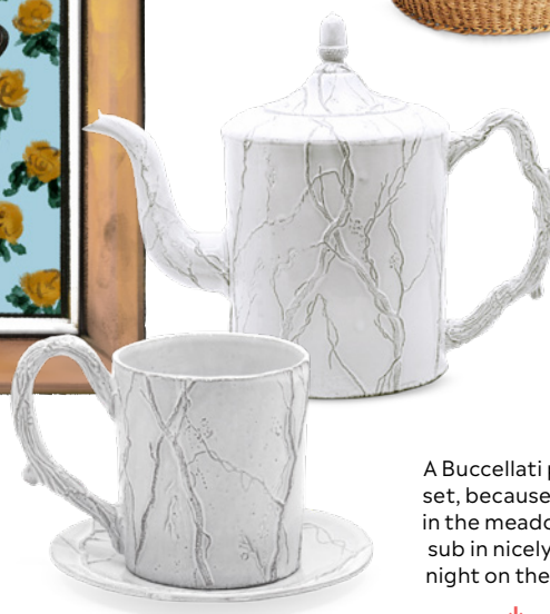
A Buccellati picnic set, because a day in the meadow will sub in nicely for a night on the town