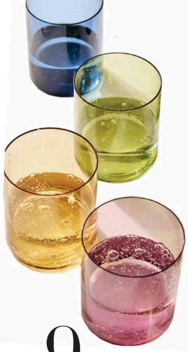
Cocktail hour is better—and brighter—than ever with the Hugo Old Fashioned Glass by HUDSON GRACE , now available in four vibrant new colors. Hugo Glasses in Lupine Blue, Aloe, Amber, and Fig. $24 each, Hudson Grace; hudsongracesf.com