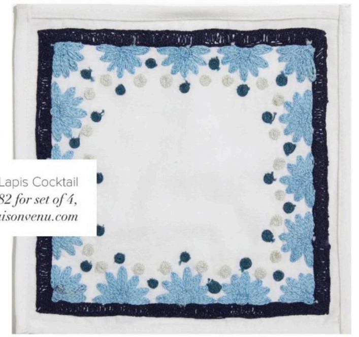
Starburst Lapis Cocktail Napkin. $82 for set of 4, Maison Venu; maisonvenu.com