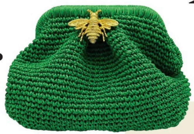
Green Customizable Pouch. $195, Garland Bags; garlandbags.com