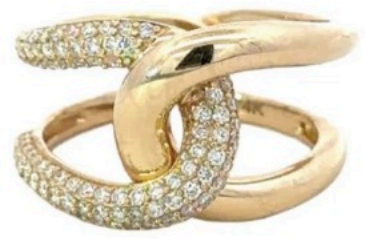
Yellow Gold Pave Diamond Puzzle Ring. $3,265, Cindy Ensor Designs; cindyensordesigns.com