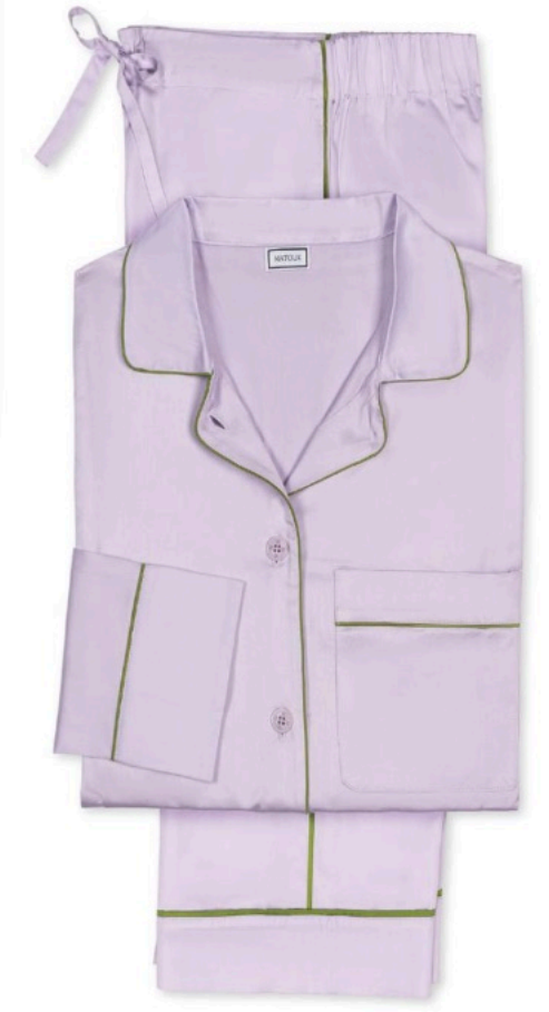
Nocturne Pajama Set in Violet/Grass. $475, Matouk; matouk.com