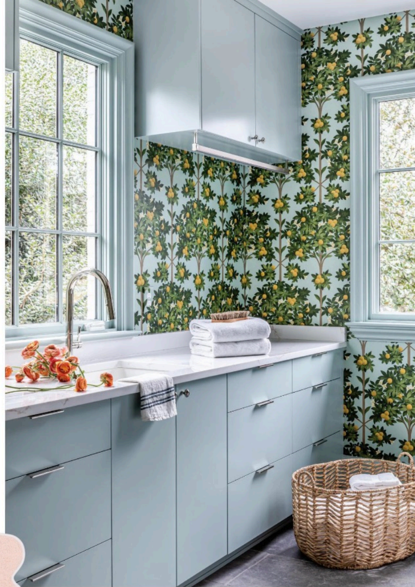
DESIGN BY ANNA BOOTH INTERIORS.

MATOUK's Cairo Scallop Tub Mat isn't just for the bathroom. The rug's scalloped edge—and cotton terry that's ideal for rooms with added moisture and humidity—makes a happy addition to the laundry space. matouk.com